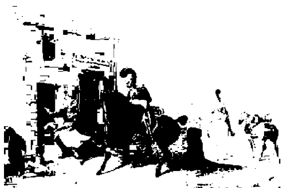
The 2003 Regimental Christmas Card