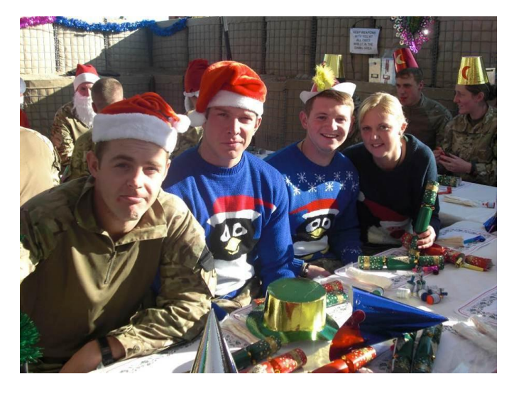
Christmas jumpers at last making a show!