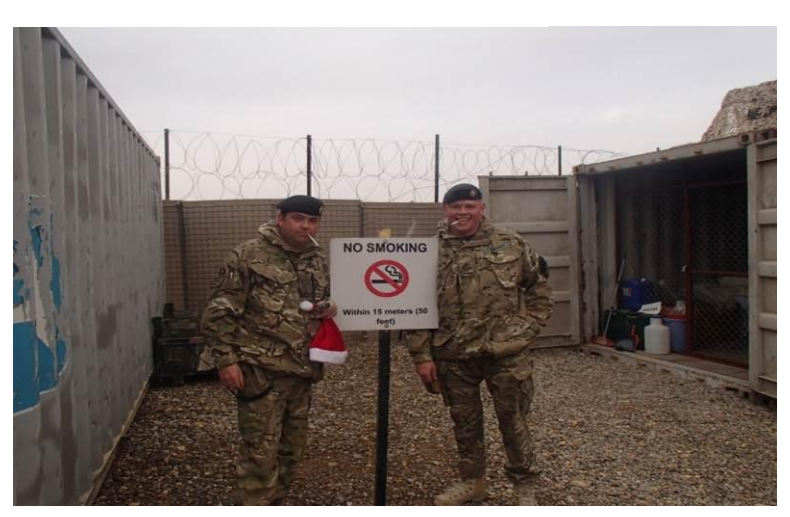
Health and Safety lessons with two jokers (great!)