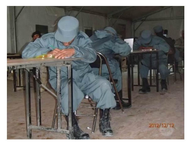
Multiple Two mentors Toli 1

Large numbers of the Policemen are illiterate, so literacy assessments are conducted in order that we can target our delivery to their needs. The course is designed by the NATO Training Mission, Afghanistan and the Ministry of Interior, Afghanistan and involves two weeks' basic literacy and six weeks of tactics. As a multiple, we are proud of the fact that much of this is now delivered by their own Officers, albeit mentored by ISAF.