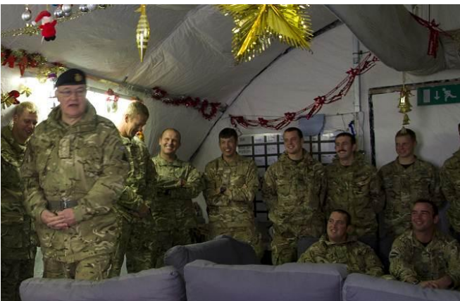
The Chief of the General Staff and the Commanding Officer.