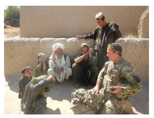
Hearts and Minds