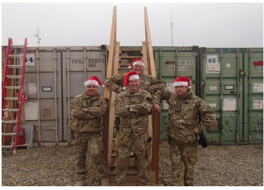
The G4 Team: thrilled not to be on R&R