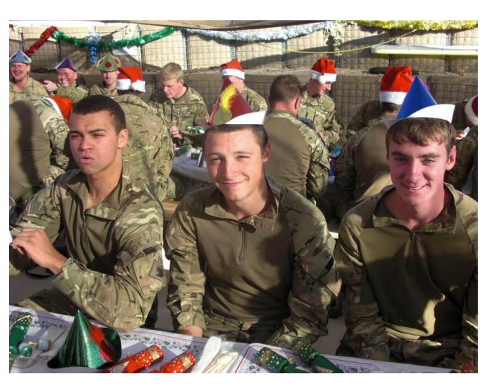
Christmas day at FOB Oullette