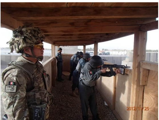
Range training for both the mentors and mentees