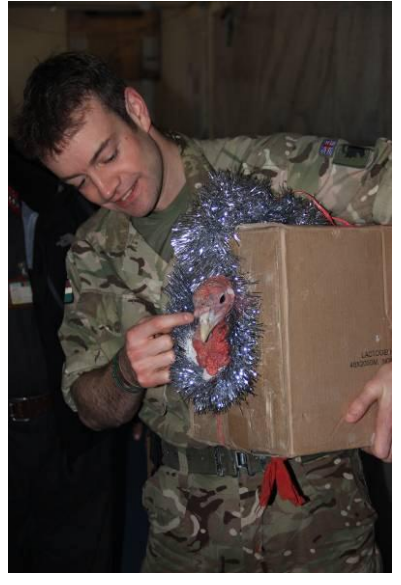
A Christmas present from our Afghan friends!