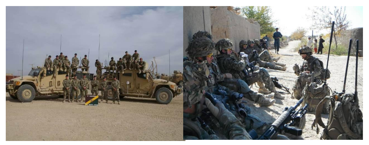
Silicon 44 complete at PB Attal

Greetings from Lashkar Gah! Silicon 44 have been an extremely busy body of men since we last sent an update. Throughout November our daily foot patrols and deliberate operations with the Afghan Police continued with great enthusiasm. As always, the Afghans have been fascinating to work with, one can't fault their enthusiasm and their hospitality is second to none. We have formed strong bonds with the Afghans we work with whilst on joint patrols, which we really enjoy. Unfortunately, this month we have had to leave our AUP friends on route 601 due our redeployment to Main Operating Base Lashkar Gah.