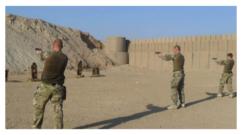
Multiple 1 on the range.

Thursday afternoons are spent conducting ISAF training. This can include things such as judgmental training, weapon handling tests, ranges, first aid, basic language lessons and many more skills which we need to operate effectively here at LTC. The judgemental training is normally run as a background activity while carrying out various shoots on the range, we enjoy all this, and it's great to see how we are improving with our Dari and Pashtu, as every week we pick up extra words and continue to build our vocabulary.