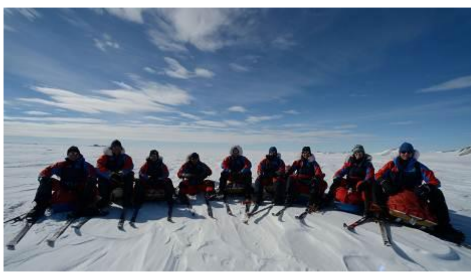
The team take a well deserved break near the South Pole.