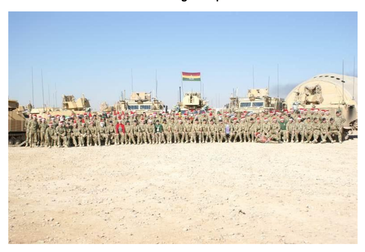
1<sup>st</sup> Troop of the Line