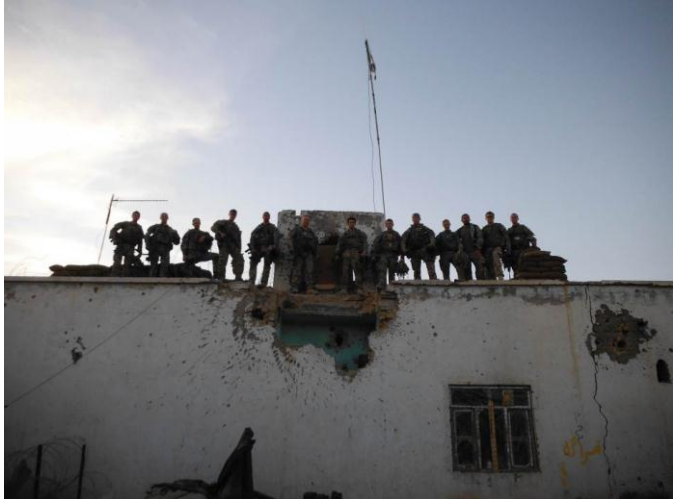
The PAT admire their handy work