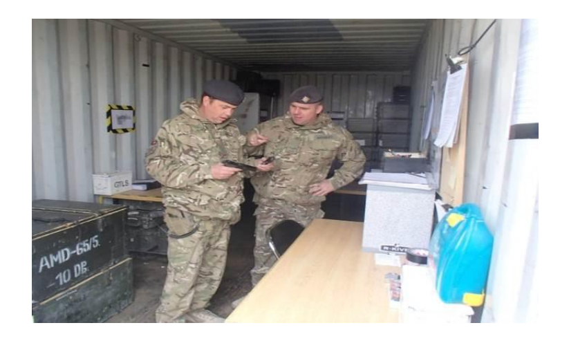
Guess which one's the Small Arms Instructor.