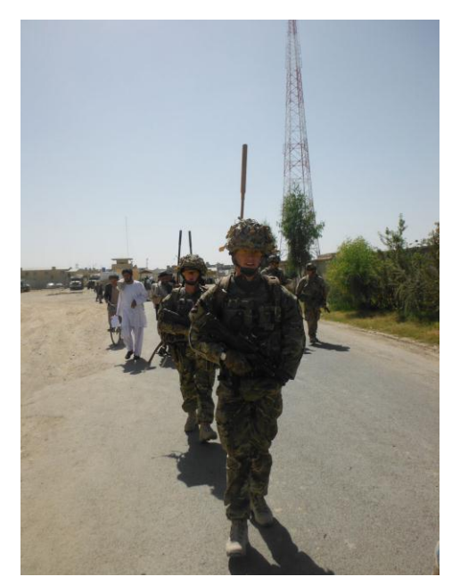
On patrol with the ANCOP