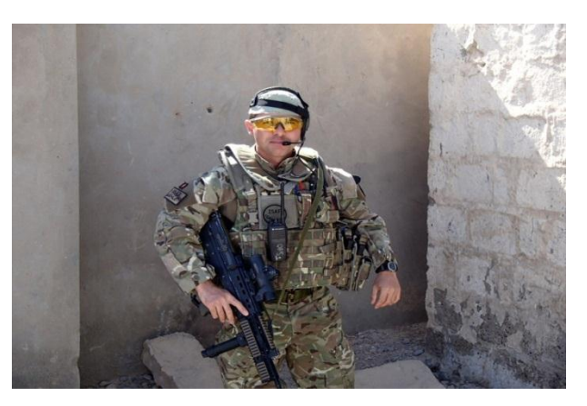
"The Blhuminator." Enough said.