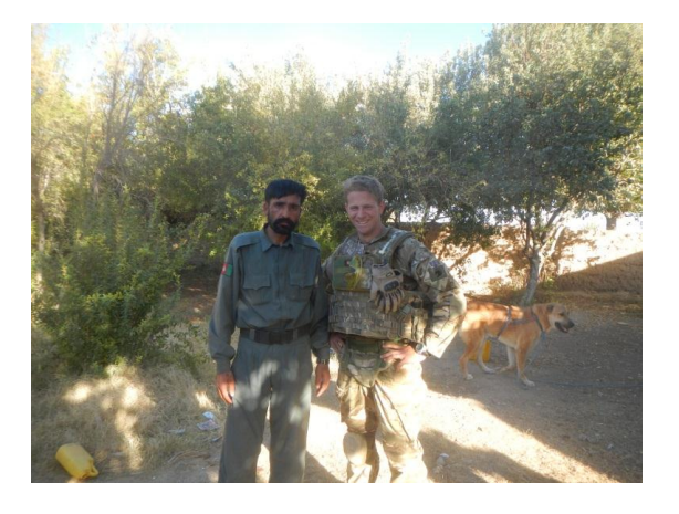
The AUP prove immune to Lt Grey's infectious happiness.

Finally, we have to say a great many thanks to everyone who has kindly sent out packages and post to all of us already- it is fantastic to receive anything from home and very much appreciated.