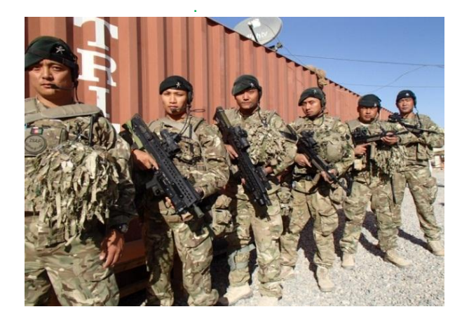
Our Brothers in Arms. Soldiers from 1 RGR.