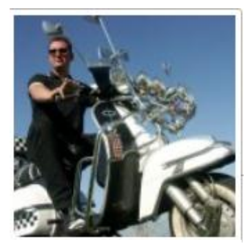
The coolest Padre in Afghan

I actually have the best job in the world. I get to travel around theatre to wherever there are members of PMAG and I've been able to do a deal with another chaplain to get to spend time with A Squadron too.