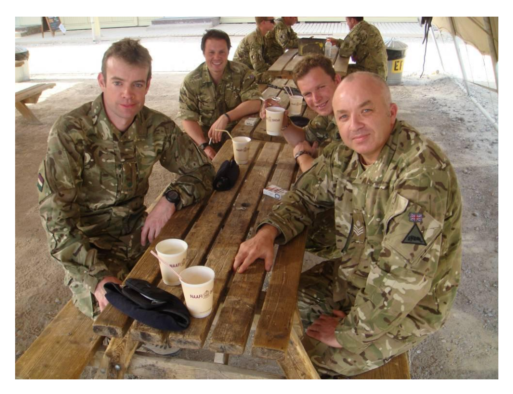
Catching up with old friends on RSOI