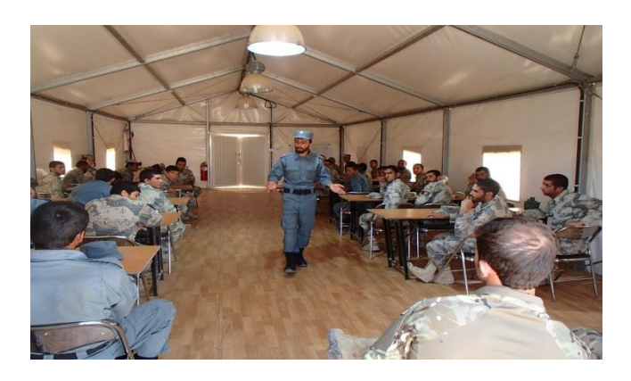
The Gold-plated solution- Afghans teaching Afghans