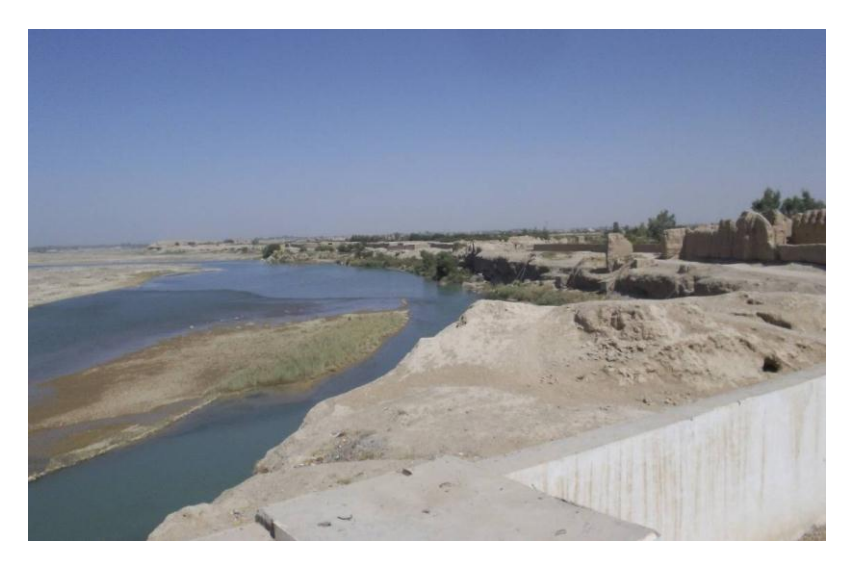
CP Bost West Karez by the River Helmand

The Policemen we have met here so far have been very friendly towards us, often drinking tea (or "Chai") with us or giving us very large apples! The checkpoints themselves are often quite basic, but are in a very interesting variety of locations and the policemen are always very welcoming.