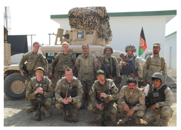
Silicon 55, just before going out on patrol

The first month has flown by as the team focused on getting to know the local area and the policemen with whom they will be training, patrolling and laughing with over the next 6