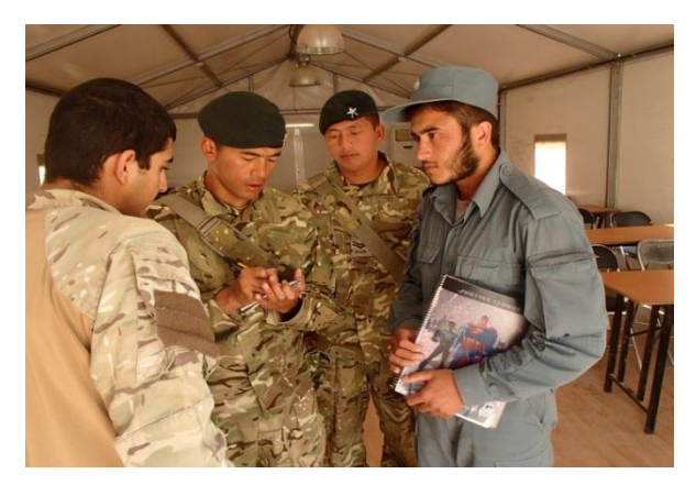
Sgt Tek in discussion with MOI at LTC