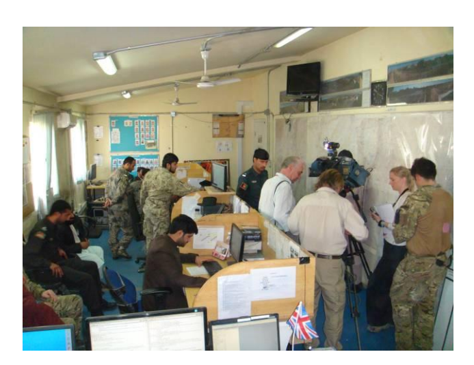
Ulster TV and the Press Association pay a visit to the OCCP.

Finally, although it has not been easy enduring long months of separation from our families, we feel lucky to have been trusted to undertake the PMAG role, which has allowed us to develop some strong bonds with our Afghan partners and interpreters. This final month has seen a raft of leaving speeches and ceremonies and it is not just RDG pennants and polished marble that changed hands at the end of this tour, but rather fond and lasting memories for both sides.