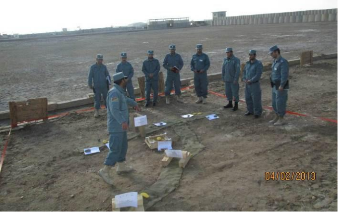
Above. AUP students run through the scheme of manoeuvre for the final exercise.