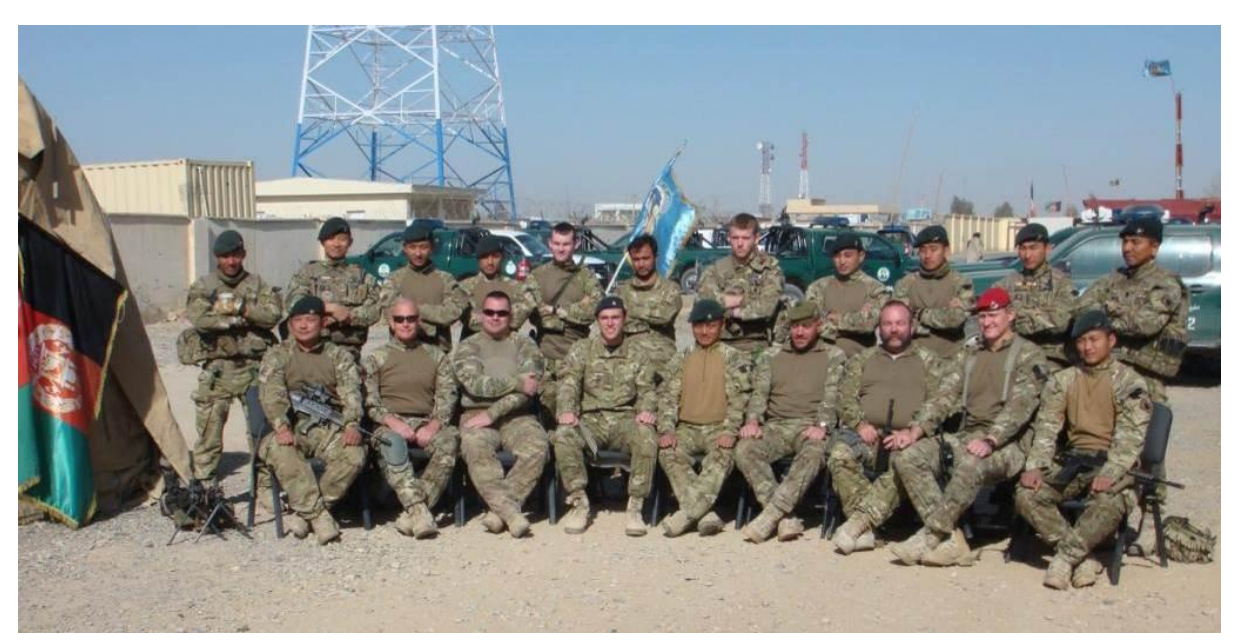
Silicon 41 at the end of their tour.

Our time in Afghanistan may have been relatively brief, but we are confident that D Squadron has left the Lashkar Gah Police in a better state that when we arrived. Thanks to the combined efforts of the PATs and SHQ, we managed to train over 80 Afghan Police instructors in counter-IED, basic first aid, vehicle maintenance and routine police skills. We have also worked hard with the District Chief of Police to help him utilise this new resource to best effect; and his men are now delivering training to large numbers of patrolmen at the Precinct level without ISAF help. The OCCP has maintained its role as the principle coordination centre for inter-ANSF operations and as we departed theatre senior AUP and ANA officers were engrossed in detailed planning for the security of a VIP visit to Helmand, it was an incredibly rewarding sight.